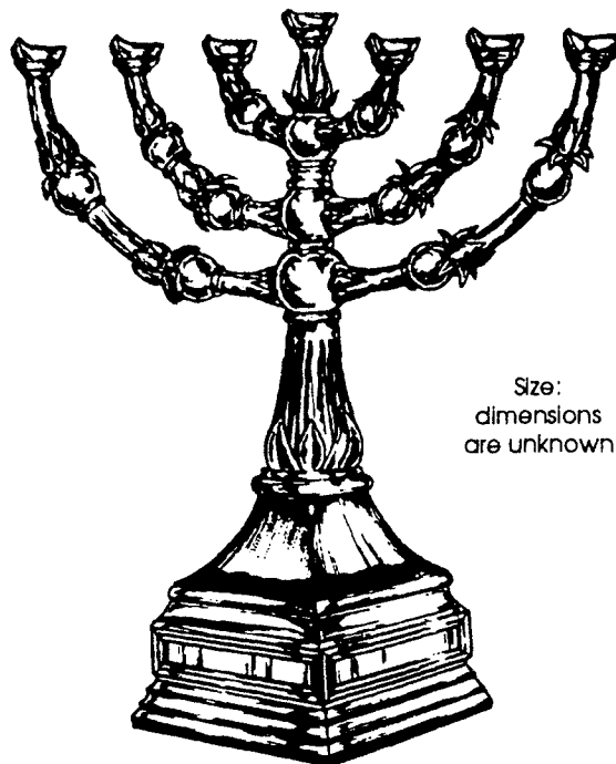
Size: dimensions are unknown

T he bread was eaten by Aaron and his sons and was replaced every week on the Sabbath. The table with the loaves was a continual reminder of the everlasting promises, the Covenant between God and the children of Israel, and a memorial of God's provision of food.