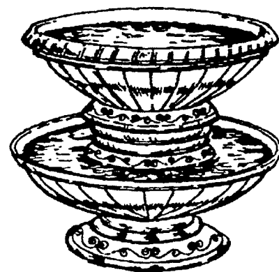
Size: no size indicated

The brazen laver was made from brass mirrors donated by the women of Israel. The Bible does not describe the laver completely, but perhaps it could be shined to have a shiny mirrored surface which would help the priest inspect himself to be sure he had washed thoroughly.