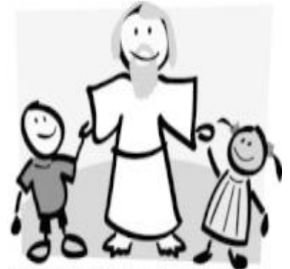
Jesus Loves the Little Children

(NLV) For sure , I tell you, whoever does not receive the holy nation of God as a child will not go into the holy nation. '