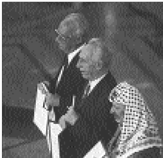
Yitzhak Rabin 1922-1995

Immediately after losing the vote for separation, the Premier of Quebec, Jacques Parizeau, resigned. His departure signaled the ascendance of Lucien Bouchard, the popular and charismatic leader of the separatist Bloc Quebecois under the