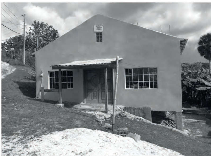
Maroon Town Congregational Building