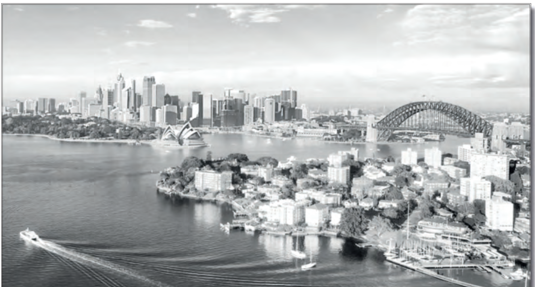
Beautiful Sydney, Australia