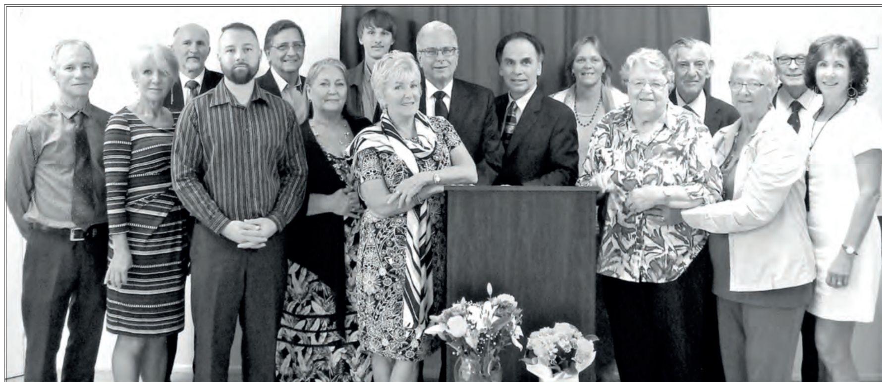
The Slack Creek CGI Congregation in Australia