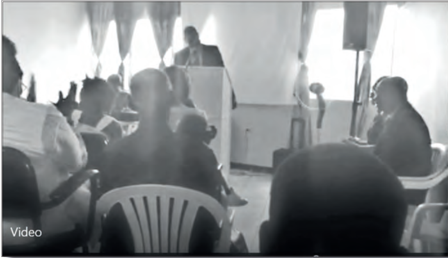
Ocho Rios Congregation