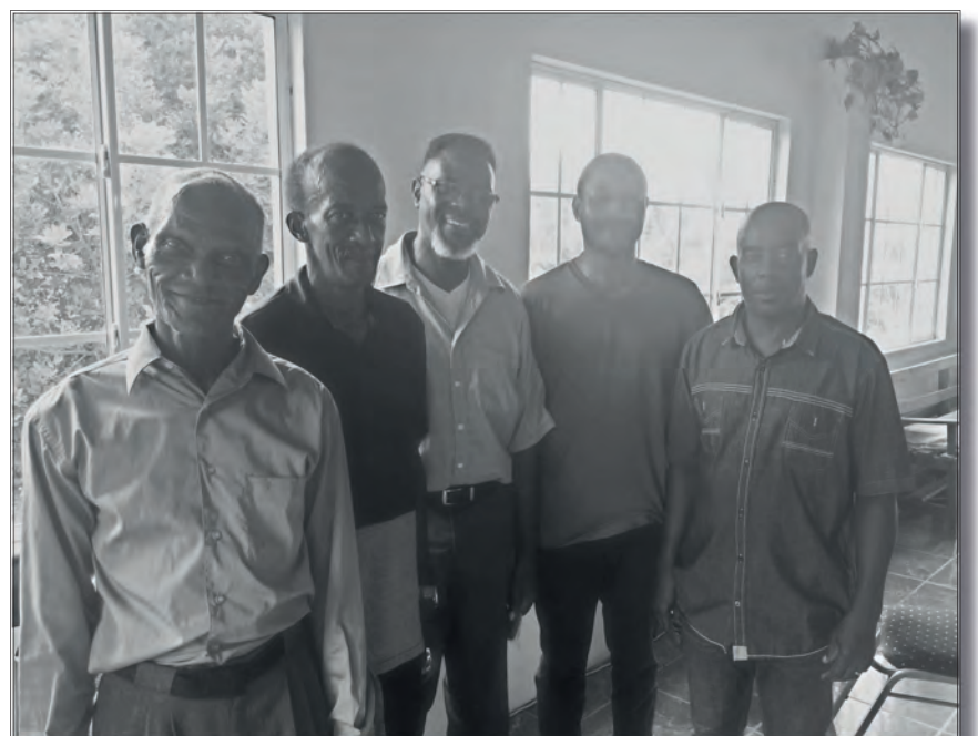
The Maroon Town Board Members