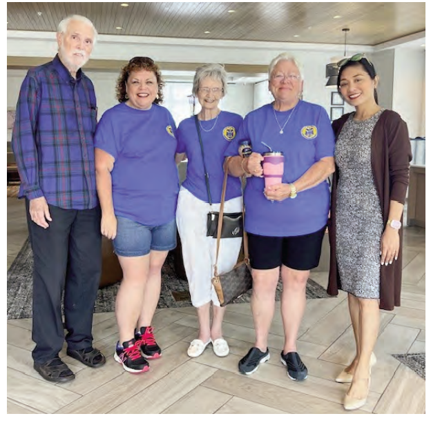
Great teaching, great food, great music, and great fun made for a great Feast of Tabernacles in Auburndale, Florida!