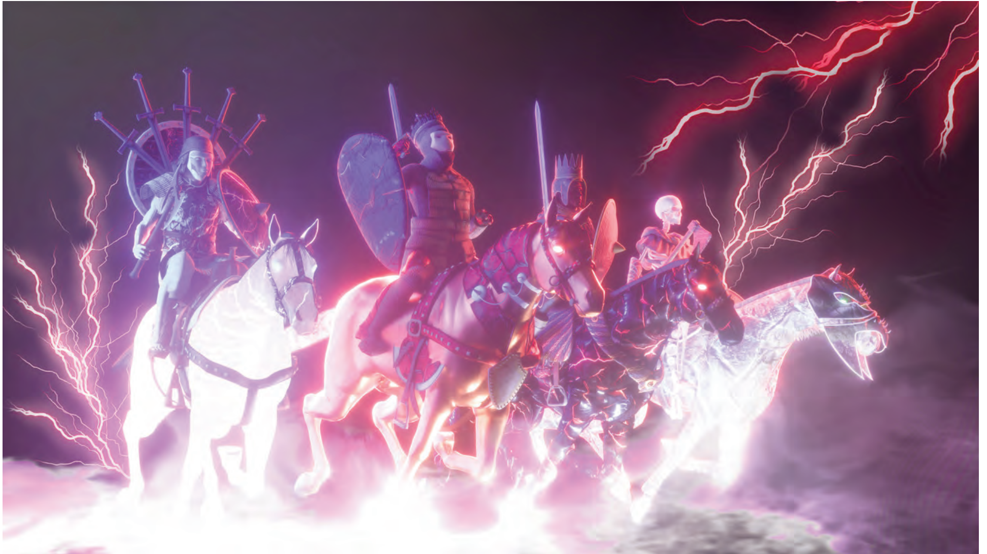
The Four Horsemen of the Apocalypse

giving a whole new meaning to the cultural hegemony of humankind!