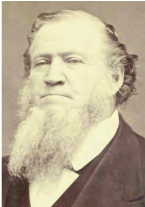
Brigham Young, second president of the LDS Church

Another major historical concern about the LDS is their view on race relations. One example can be found in the Book of Mormon (2 Nephi 5:21–25). In their scriptures, the Mormons suggest that some of their forefathers (ancient Israelites in America) were turned a darker color because they were cursed by God. One reason for the cursing is so they will not mix with the white people. This section of their scripture also calls white people as “fair and delightsome.” The darker skinned people were also described as “...an idle people, full of mischief and