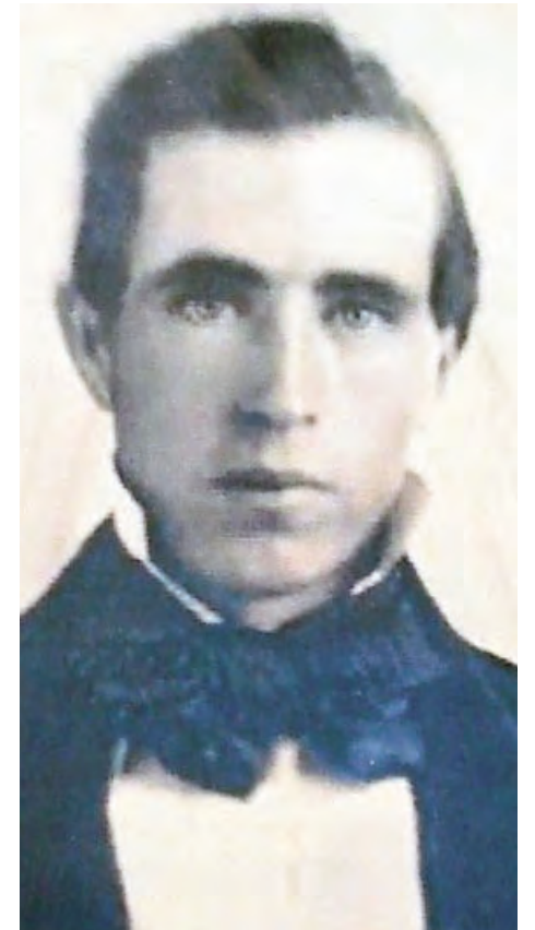
Joseph Smith, founder of Mormonism

There is nothing wrong with talking to Mormon missionaries who come to your door, but ask them some of the hard questions you can develop from what is written here. There is always hope for those who have been deceived.