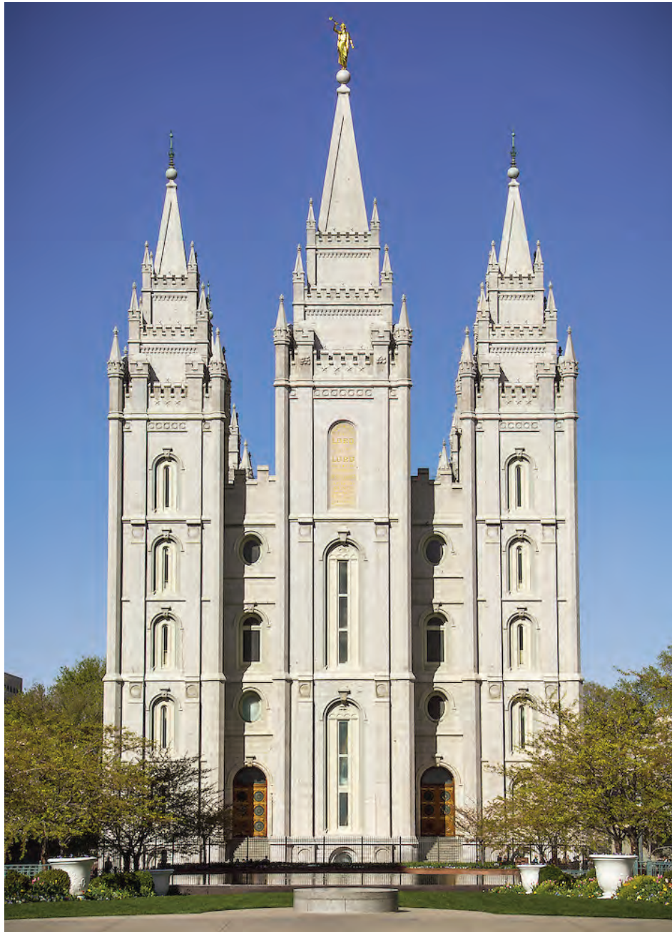
LDS temple in Salt Lake City, Utah

A few years later, in 1823, Smith has another vision at his bedside from the angel Moroni. Moroni informs the 17-year-old Smith that he will be provided a book (Book of Mormon) with the