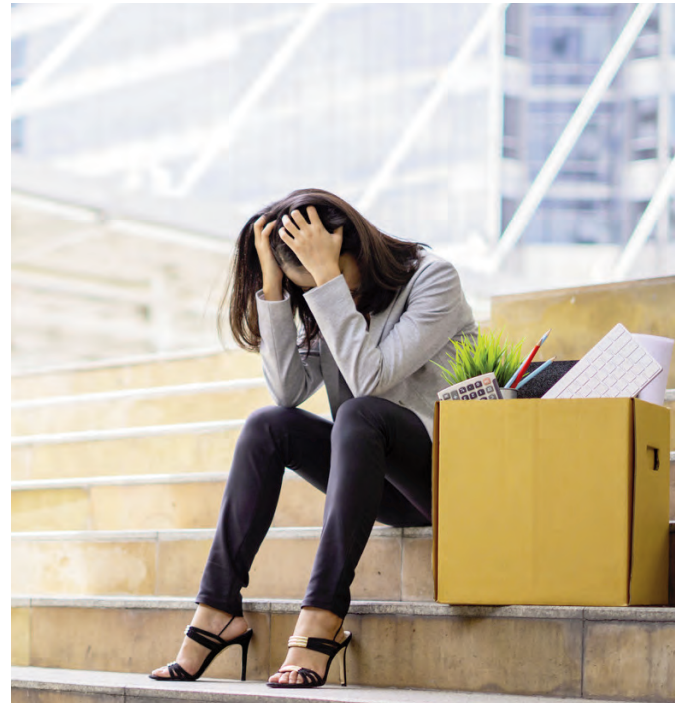
Loss of a job can be overwhelmingly stressful.

And with that, it becomes important to our lifestyles we do Him honorably in our lives. This is why Paul launches into two primary categories of our lives—family and career. In verses 18–22 Paul addresses specifically husbands, wives, children, child-rearing, and employment [servants], and encourages us to keep this in mind: "... whatsoever you do, do it heartily, as unto the Lord [as though you are working for Christ, one on one] and not unto men; knowing that of the Lord you shall receive the reward of the inheritance [because in the end, God will determine how well you did, which