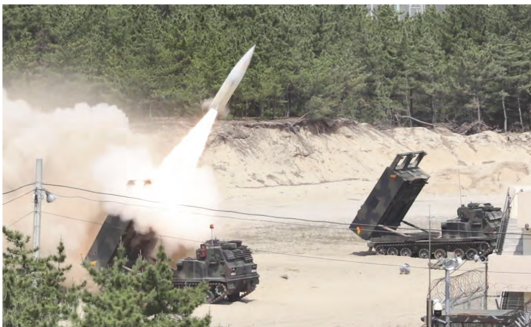
North Korean missile launch

So, in summary, keep in mind that God will remember how we lived, and we will be rewarded according to "God's evaluation of our works, our behaviors," not necessarily the behaviors that make us feel good. It's His will in our lives, the Christ-like will that we want to exemplify and embrace. So in conclusion: live your life in a way consistent with how you