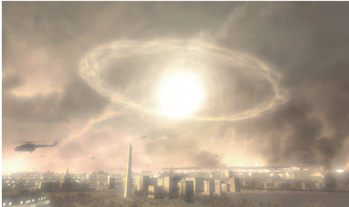
An EMP attack could damage or destroy the electronics we depend on over a vast region.